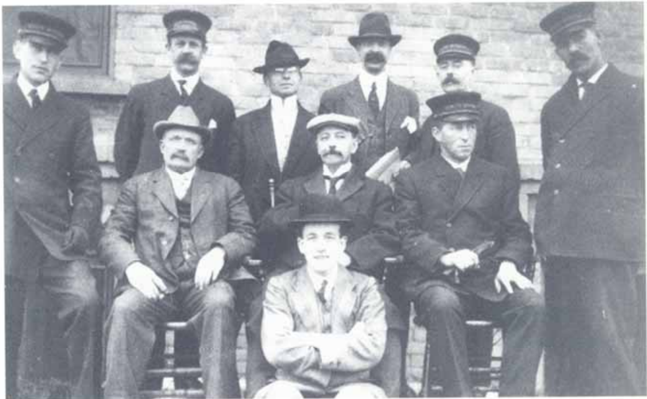
Health Inspectors circa 1912

The Newsletter is only produced in an electronic format and is distributed to the membership through their respective Branch President or designate.