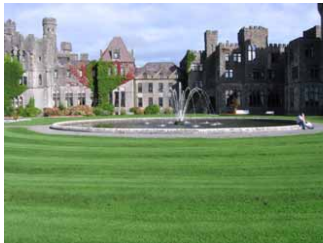
Ashford Castle, Cong, Ireland